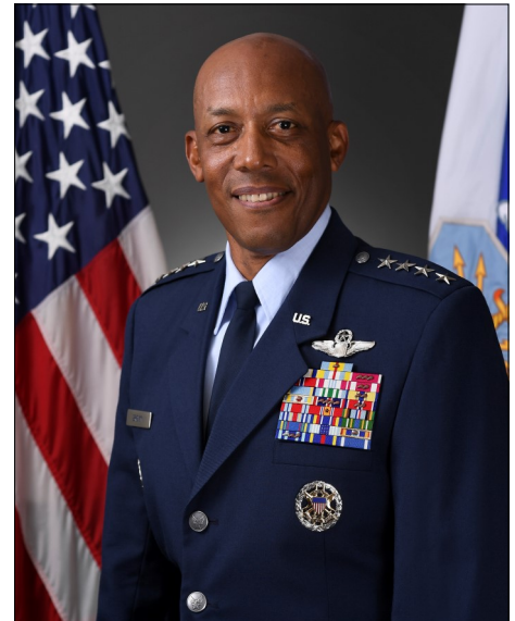
Air Force Chief of Staff Gen. Charles Q. Brown Jr.

Visit almost any Air Force installation and you can find retired